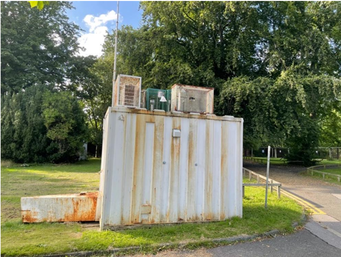
Picture: the site of the Helicopter Landing Place